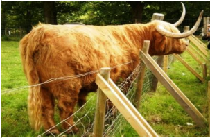
(Sexy Hamish... Apparently)

Hayden who is currently at Seaford College in the UK certainly had a busy summer holidays. Over the course of four weeks he travelled just about the length and breadth of England and Scotland, as well as managing day trips into Wales, and across to Isle of Skye which lies off the North Western coast of mainland Scotland.